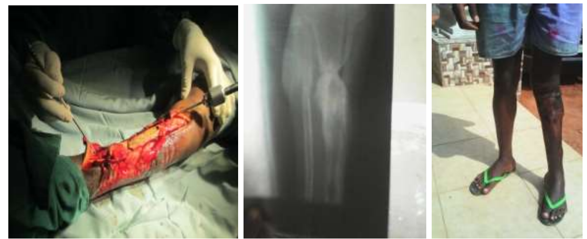
Fig 6 & 7: showing limb and x-ray of a patient before procedure