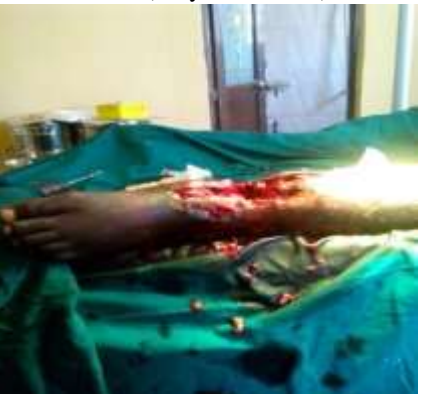
Fig 2: Intra –op debridement