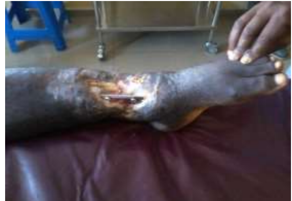
Fig 1: Pre-op picture showing sequestrum and implant