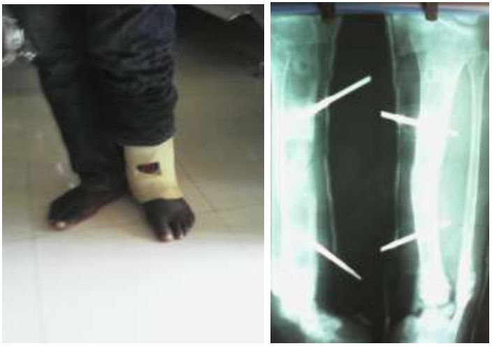
Fig 4& 5: Limb in cast during consolidation and check x-ray